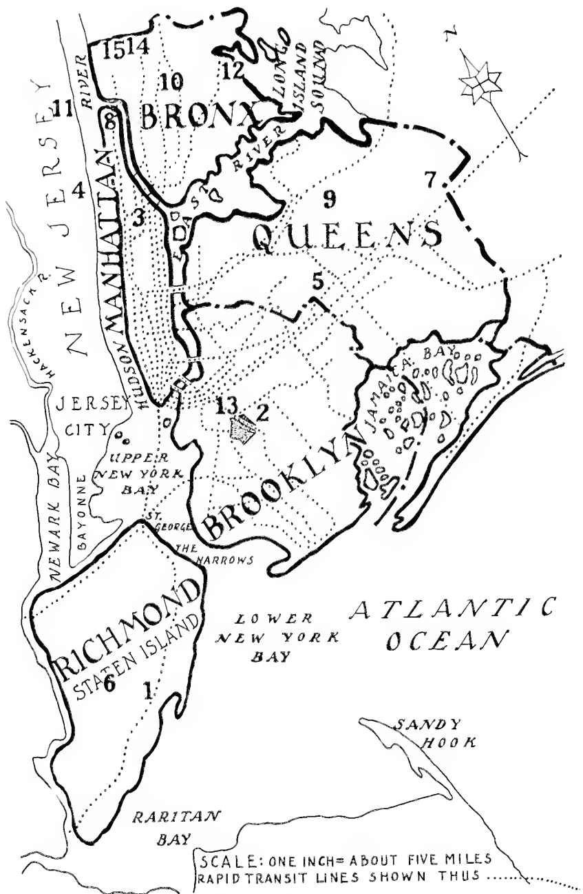
MAP SHOWING THE GREATER NEW YORK REGION. THE NUMBERS CORRESPOND TO THOSE OF THE PATHFINDER BEGINNING ON THE NEXT PAGE.